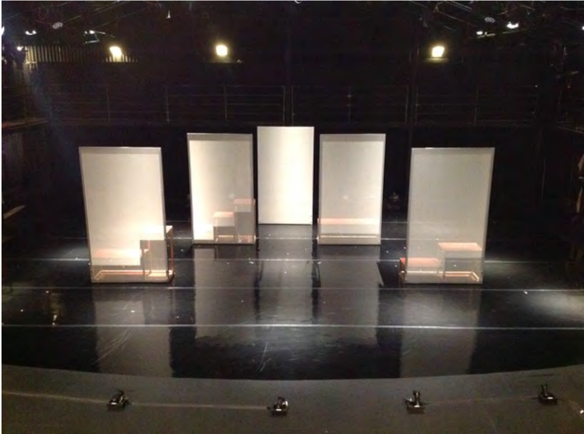
This is a photo of how the set will look before the show starts.