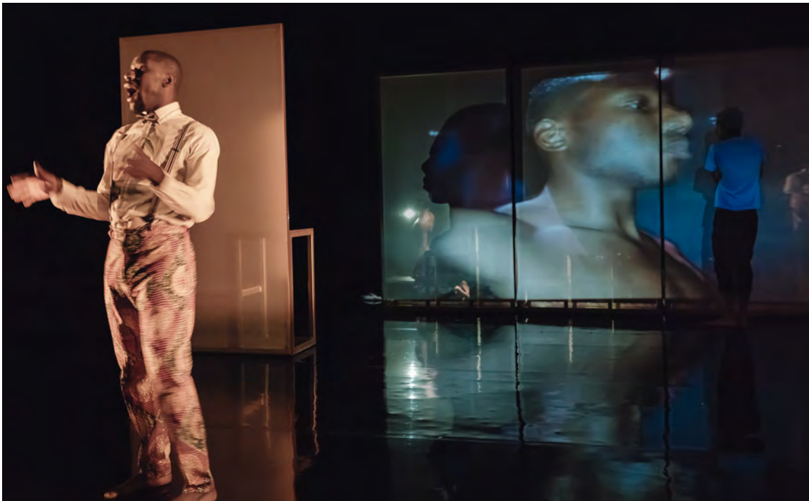
This is a photo of one of the scenes that use projections

During some scenes, video will be projected on to the five fabric panels on stage. These projections will range from text, to recorded video, to live broadcasting what is happening on different parts of the stage.