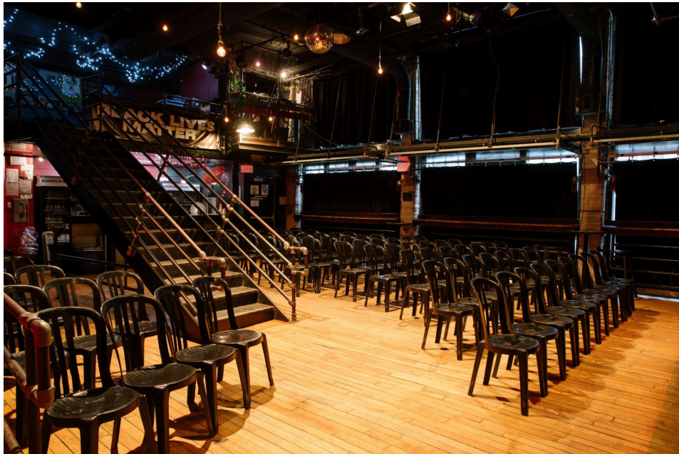
This is the audience seating in the Cabaret.

There is no assigned seating in the Cabaret theatre space. You may sit in any unoccupied seat, unless it has a reserved sign on it. For your safety, you should not go onto the stage at any time.