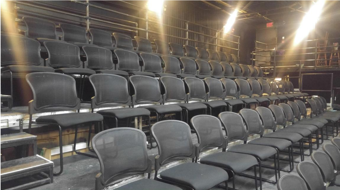
This is the audience seating area

The show takes place in the Chamber space at Buddies. There is no assigned seating in the theatre, so you may sit in any unoccupied seat, unless it has a reserved sign on it.