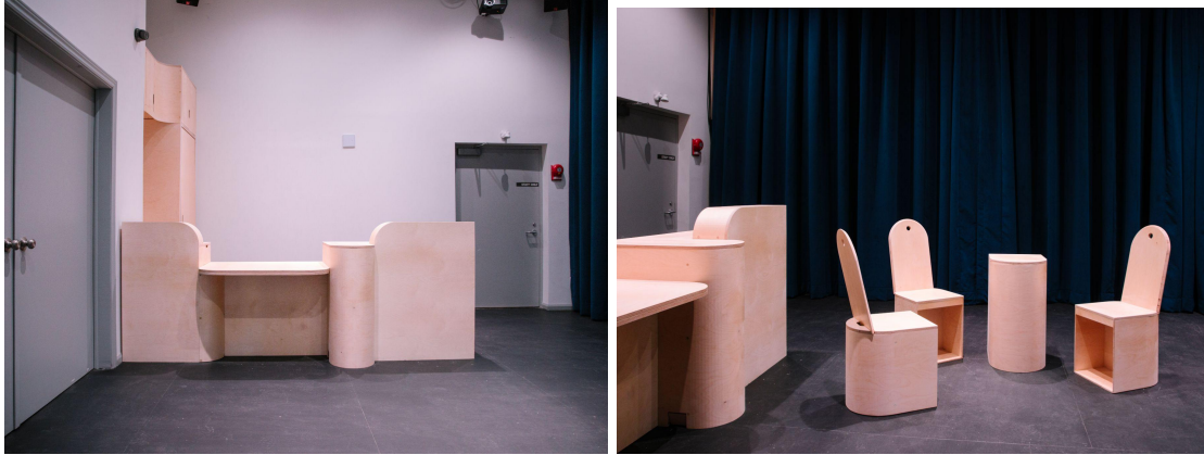
This is the Antechamber space.