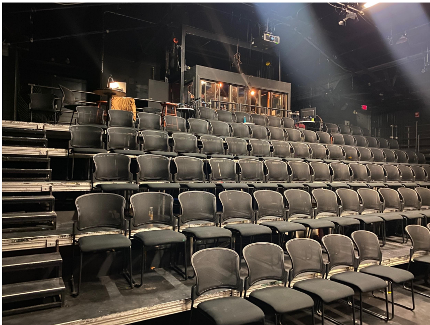
This is the audience seating in the Chamber.

There is no assigned seating in the Chamber theatre space. You may sit in any unoccupied seat, unless it has a reserved sign on it. All seats will be a minimum of 6 feet away from the performer on stage for audience safety, as the performer will be unmasked for the duration of the show. For your safety, you should not go onto the performing space at any time.