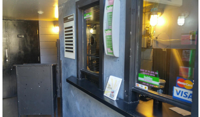
Pictured: the box office entrance through the ramp on the side of the building, and the box office.

Here in the lobby is where you may wait for the show to begin. There are two screens above where you may view the bios and headshots of the creative team of the show.