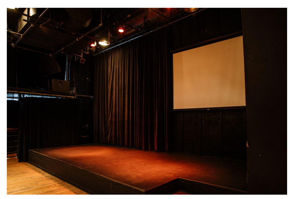
This is the stage- without the set added.